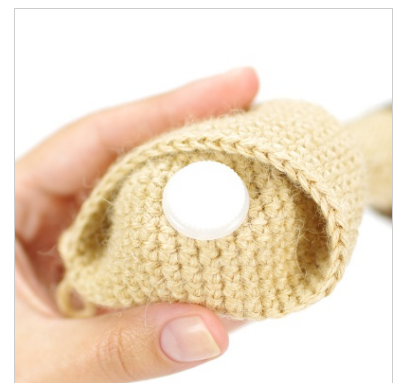
3. And then locked to place inside the body.