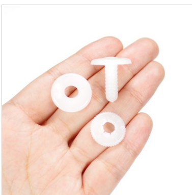
1. Plastic doll joints come in three pieces - disk with a stem, washer and a fastener.