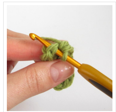
9. Do not join round. Insert the hook in to the first stitch of last round and start the new round.