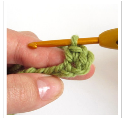
3. Crochet two single crochet stitches in to this chain.