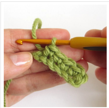
4. Crochet one single crochet stitch in to next three chains.