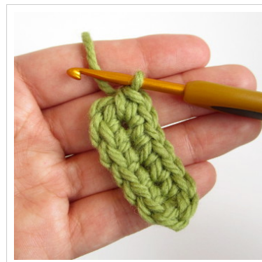
8. Crochet two single crochet stitches in to the first chain (total of four stitches).