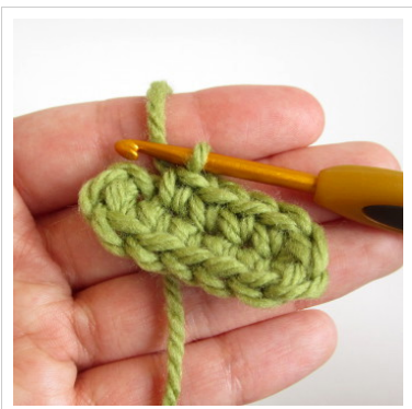
7. Crochet one single crochet stitch in to next three chains.