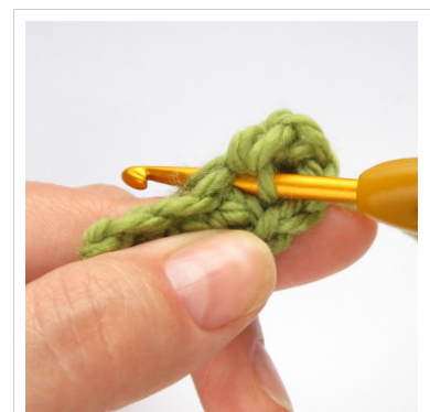
6. Turn and work on the other side of the beginning chain.