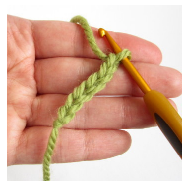
1. Chain six. This will be the base for the first round.

Rnd1: chain 6, 2 sc in to the second chain from hook, sc 3, 4 sc in to the last chain, Turn and work on other side of beginning chain! sc 3, two sc in to the first chain. Do not join round.