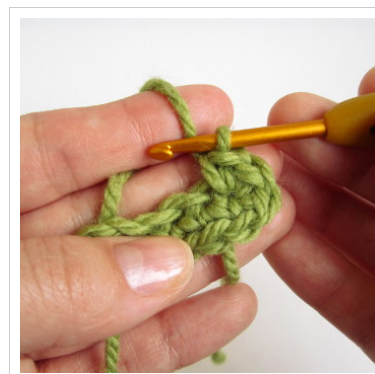
5. Crochet four single crochet stitches in to the first chain.